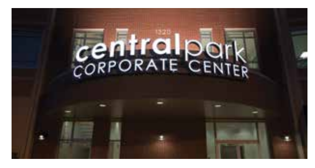
Central Park Corporate Center